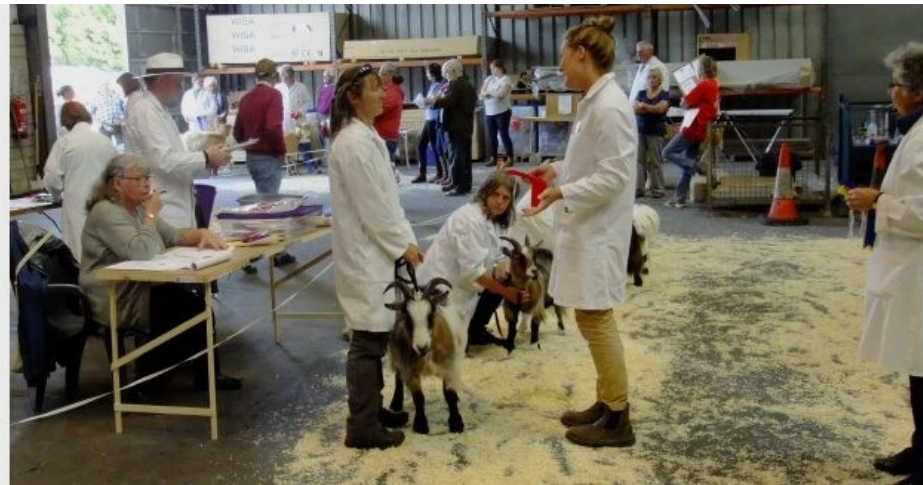
Pygmy Autumn Show 2017